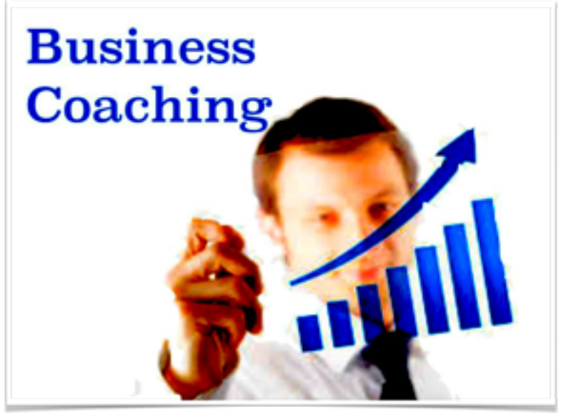
Having a Business Coach is an accelerator for your business....

Train line managers to coach in order to meet business and regulatory requirements. We believe in implementing meaningful learning and development initiatives for emerging leaders to executive leads, so that they can grow to higher levels of success.